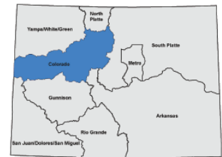
Territories of CO’s basin roundtables