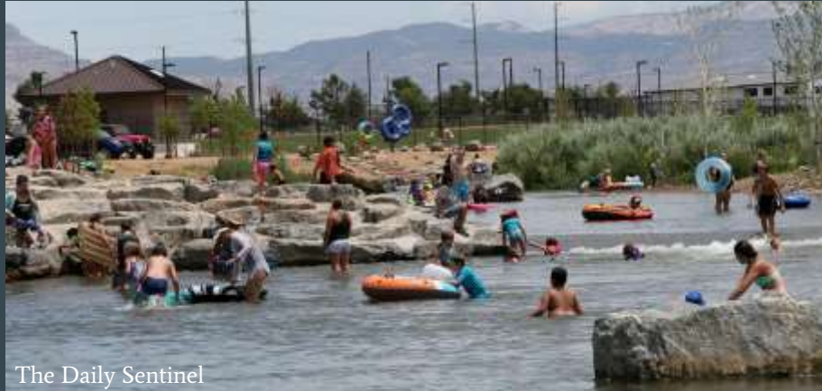
The Daily Sentinel