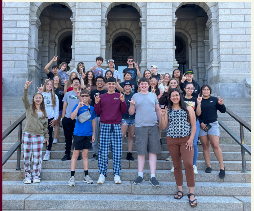
Upward Bound Students at the Colorado State Capitol, July 2023

✓ Complete the Boettcher Scholarship Application by November 1!