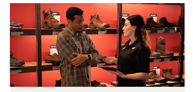
Consult / Listen as crew members describe their job and work environment.