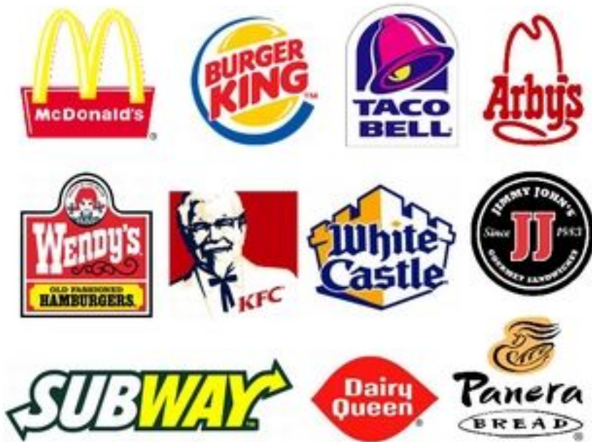
Environmental Print Signs