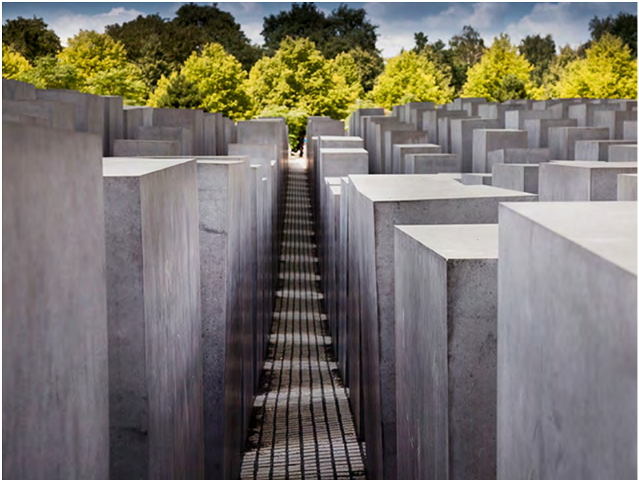
Photo credit: AFAR: Memorial to the Murdered Jews of Europe ( https://www.afar.com/places/memorial-to-the-murdered-jews-of-europe-berlin )

A memorial can serve as a place of remembrance, communication, and grieving for the loss of loved ones. However, it can also function as a visual reminder of an event or time in history or a warning to future populations. It can be used as a powerful visual education tool to inform younger generations. The Memorial to the Murdered Jews of Europe serves all of these purposes.