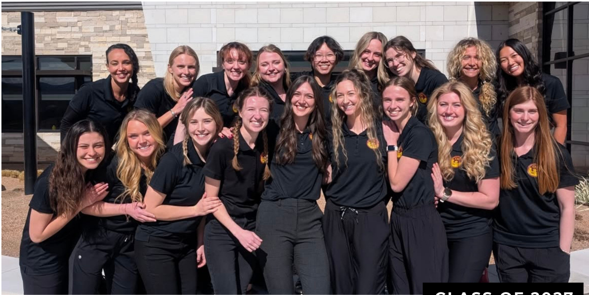
CLASS OF 2027