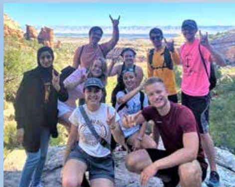
Colorado National Monument