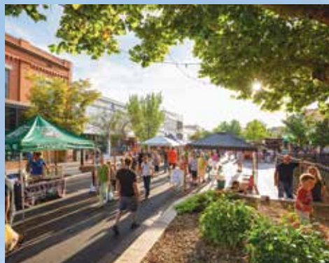
Downtown Grand Junction