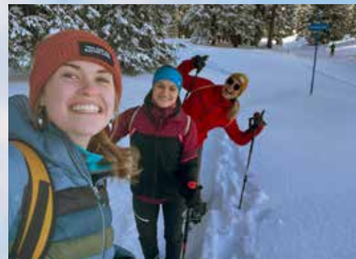
Grand Mesa National Forest