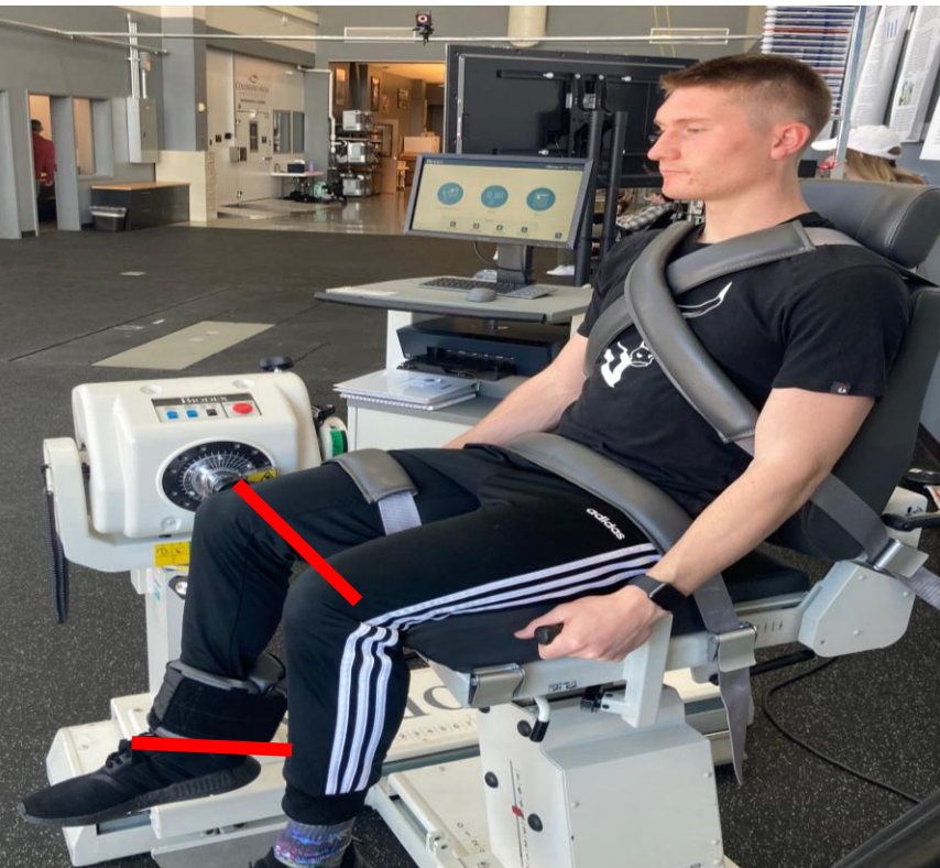
Figure a. The Biodex was fitted for each participant so that the rotation axis of the dynamometer was lined up with the lateral epicondyle of the dominate legs femur. The leg attachment was adjusted so that the bottom of the ankle pad was at the participants superior border of the medial malleolus. Additionally, straps were attached to the trunk, hip, and dominant thigh to reduce compensatory movements.

The study included six male division II collegiate short and long sprinters (100-400m) (Age 20 \pm 1.25 years, height 180 \pm 5.6 cm, and body mass 74 \pm 8.96 kg) who were in-season and had no prior experience with the Biodex. Subjects completed a crossover design under all three conditions one week apart at the same time on the same day of the week. The sessions began with a 10-minute acclimatization period sitting at room temperature (23°C), before beginning their randomly selected treatment. Preheating consisted of a moist heat pack (69°C) wrapped in a cover (~5 towel layers), and precooling consisted of an ice bag (1000mL), wrapped in a singular moist towel (0°C), both treatments were applied directly to the middle hamstrings for 20 minutes. Testing consisted of 3 sets of 3 maximal isokinetic knee extension and flexion repetitions at 180 degrees per second with 30 seconds of rest between sets to measure peak torque during knee flexion.