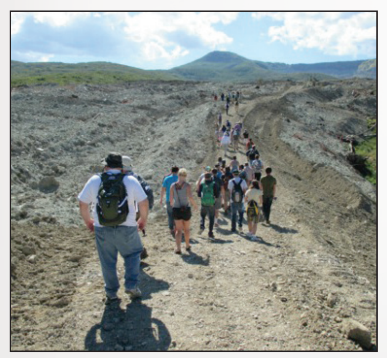
WSFC 2014 The Slide located near Collbran, CO.

Colorado Mesa University geology program hosted the 2014 Western Slope Field Conference from Sept 12 – 14. The meeting was a great success and was attended by about 30 current students, some Fort Lewis College students, and CMU Geology alumni. A (mostly) carnivorous barbeque at Island Acres State