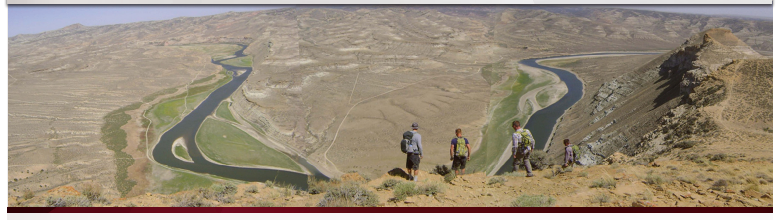
CMU Field Camp, Summer, 2012, Green River overlook, Green River, WY